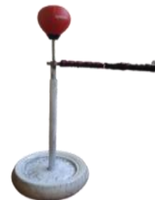
Figure 3. The Standing Punching Pad after Development