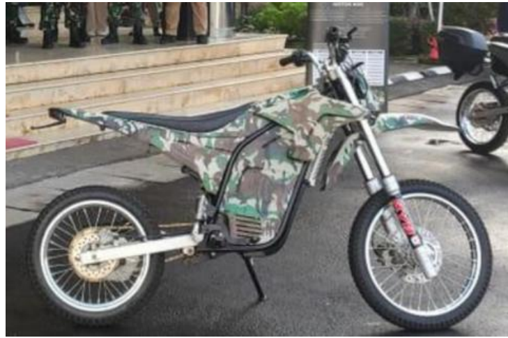
Figure 1. Electric Tactical Motor Bike

Figure 1 is the shape of an electric motorbike that has a fast charging function of 1200 A and can be used for a distance of 80 kilometers. However, one of the problems with this car is that it takes a long time to charge, which requires a charger that can charge quickly so that it can be used in emergency situations.