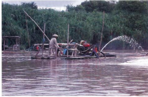
Figure 2. Zircon mining in gold mine tailings, Central Kalimantan ( Rohmana & Gunradi, 2006 )