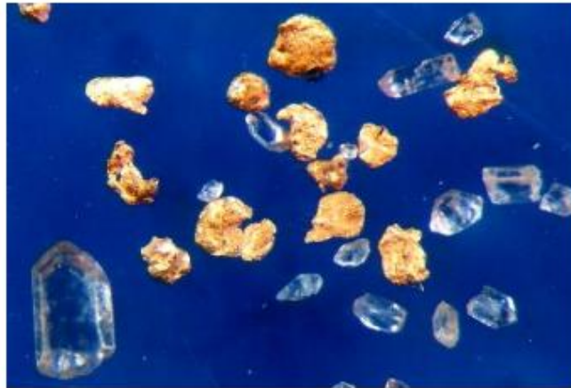
Figure 4. Gold and zircon, magnification \pm 30x , Katingan, South Kalimantan (Rohmana & Gunradi, 2006).