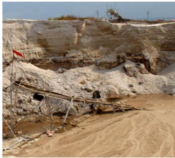
Figure 3. Results of mining and processing gold and zircon at the Katingan gold mine, West Kalimantan ( Djunaedi & Sukaesih, 2007 )

The Geological Resource Center balance sheet (2007) recorded monazite ore reserves of 185,992 tons. This potential exists in the main tin producing areas, including Bangka, Belitung, Kundur and Kampar ( Djunaedi & Sukaesih, 2007 ). Meanwhile, recent developments will increase the discovery of monazite resources with intensive exploration activities. Apart from being produced in alluvial and gold ores, rare minerals are also found in uranium ores. Uranium ore in Rirang, West Kalimantan is mined from the upper, middle and lower valleys of Rirang. Figure 4 is the mining results obtained in West Kalimantan which contain elements in Rirang ore that have potential economic value, namely uranium (U) 8528.75 ppm, rare earth elements (UTJO3) 60.85%, phosphate (PO4) 32.84 n thorium (Th) 861.5 ppm which produces uranium in the amount of 178.43 tons per year ( Erni et al., 2004 ).