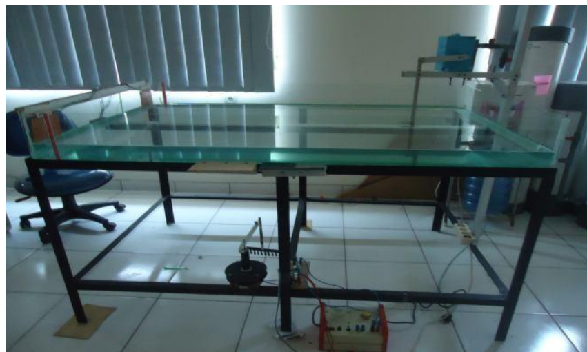
Figure 2. Ripple tank

Figure 2 is a ripple tank with a water depth of 7 cm, the wave lighter and sensor are placed on opposite sides to the left and right respectively. The frequency of the wave-ignition made is 1.95 Hz, obtained from 117 times of igniting the wave per minute with a period of 0.51 s. The wave height sensor is used to determine the physical effects that occur with the light indicator. The wave height sensor has 5 different LED colors namely red, yellow, blue, green, and white. The distance on each led is 0.5 cm. But from the surface of the water to the white led is 0.3 cm, so when the wave height from the bottom of the water surface is 0.8 cm it will turn on the white and green led lights, if the wave height is 1.3 cm it will turn on three leds white, green, and blue. Red led light will turn on when high.