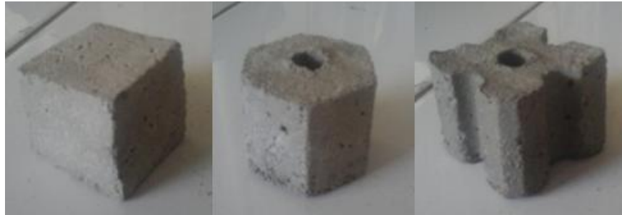
Figure 1. Breakwater model (Cube, Seabee and Grooved cube with hole).

The breakwater model used is shown in Figure 1, namely the cube, Seabee and grooved cube with hole models. The three breakwater models were then tested using a ripple tank by varying their arrangement to see their effectiveness. The data taken is in the form of maximum wave height data ( H_{max} ) and minimum wave height data ( H_{min} ) before and after passing through the breakwater model. From the wave height data, it is possible to know the values of K_r , K_t and K_d for each model by varying the arrangement.