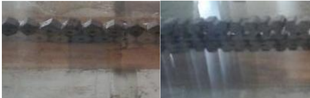
Figure 4. Models by stacking 2 layers

Figure 3 shows that of the three concrete block models, the cube model is the model that has the highest K_r and K_t values while the K_d value is zero, meaning that the model is not effective in reducing wave energy. For seabee concrete blocks and grooved cube with holes, based on their arrangement, the most effective in reducing wave energy is the horizontally arranged grooved cube with holes model. This is because this model has a large K_d value of 0.48 compared to the Seabee model and has the lowest K_r and K_t values of 0.45 and 0.7. Based on the data analysis, it can be concluded that the concrete block model with holes is more effective in reducing wave energy than the concrete block model without holes.